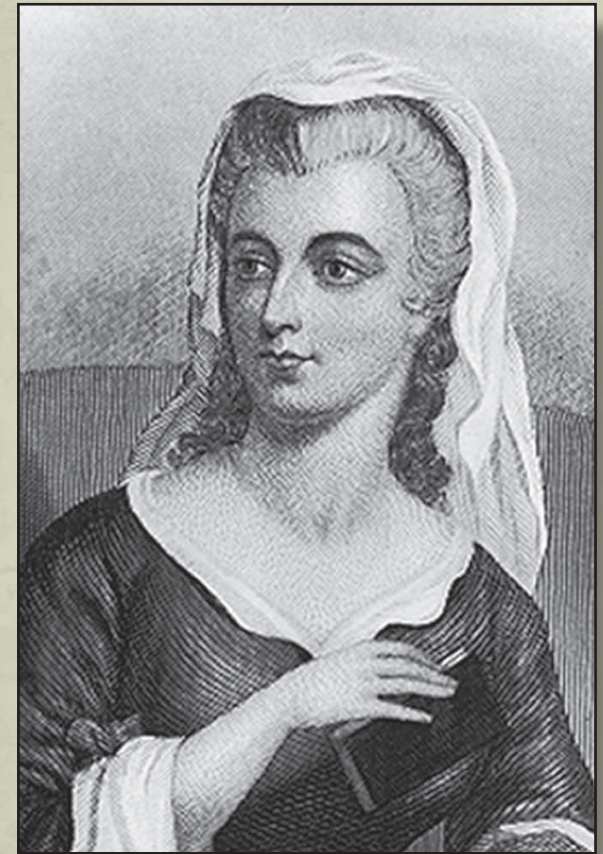
SUSANNA WESLEY MOTHER OF JOHN & CHARLES WESLEY

If you have questions or need additional information, please call 615-340-7145, or visit the website at: www.gcumm.org .